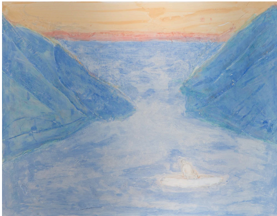
Raúl Díaz, Lago III , 2017, mixed media on wood panel, 50 3/8 x 64 3/4 inches