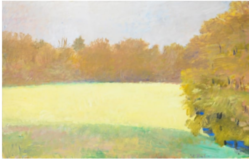
Wolf Kahn, Meadow Bordered by a Brook , 1984, Oil on canvas, 44 x 70 inches