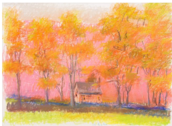
Wolf Kahn, Brilliant Landscape , 1991, Pastel on paper, 21 x 29 inches