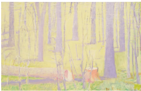
Wolf Kahn, How Low the Mighty Have Fallen II , 2002, Oil on canvas, 42 x 66 inches