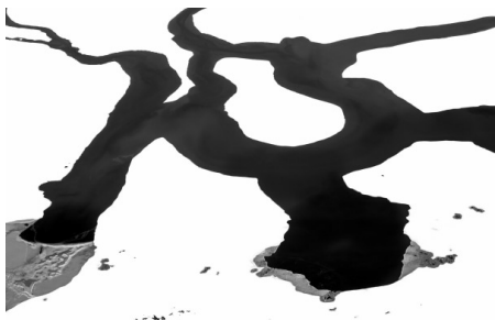
Tuck Fauntleroy, Confluence II , edition 1 of 9, 2024, Archival pigment print, 40 x 60 inches