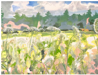
Eric Aho, Wild Meadow , 2024, Oil on linen, 56 x 73 3/4 inches