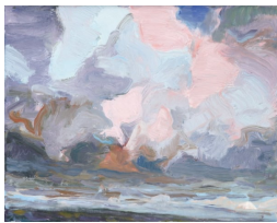
Eric Aho, Cloud , 2024, Oil on linen, 11 x 14 inches

Specializing in modern and contemporary art, Maya Frodeman Gallery unites artists from all over the world in a tightly curated vision. Maya Frodeman Gallery began in 2024, continuing the 23-year legacy of Tayloe Piggott's eponymous gallery, the first of its kind in Jackson Hole, Wyoming. In an expansive exhibition space in downtown Jackson Hole, the gallery pursues a rigorous schedule of exhibitions representing both emerging and established artists, encompassing unique practices of painting, sculpture, paper, photography, and printmaking.