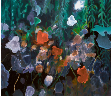
Eric Aho, Second Dutch Meadow (Black tulips) , 2024, Oil on linen, 52 x 60 inches