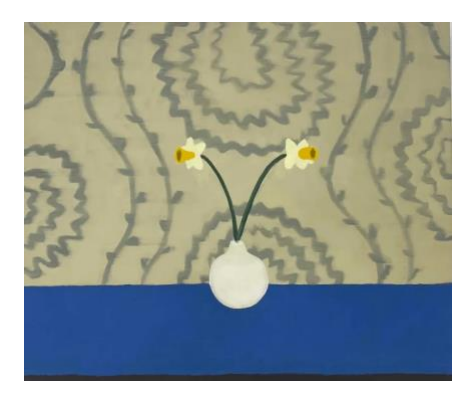
Mike Piggott, Two Daffodils No. 2, 2025, Oil on canvas, 20 x 24 inches