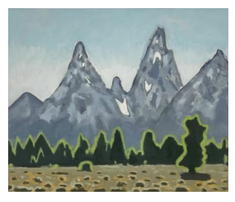
Mike Piggott, Tetons No. 1, 2025, Oil on linen, 20 x 24 inches