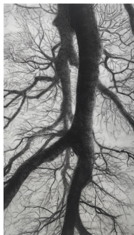
Jeffrey Blondes, 22-01D Bois de Mametz 18h32m42s , 2020, Charcoal on paper, 55 ½ x 35 inches