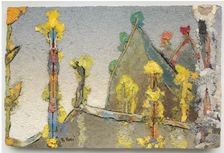
Roland Poska Untitled, 1970's Cotton fiber and pigment