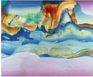
Elliott Green, Shout , 2021, Oil on linen, 76 x 92 inches