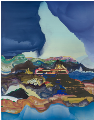
Elliott Green, Heavy Shit in Candy-Land , 2019, Oil on linen, 90 x 70 inches