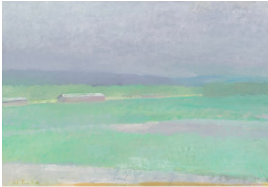
Wolf Kahn, Tobacco Valley (AKA Tobacco Barns) , 1983, Oil on canvas, 36 x 52 inches

Wolf Kahn adhered to a strict non-program program. Even at the end of his life, he was still very much a student of Hans Hofmann. There was an affectionate contrariness about him and the way he described his work. "I try not to," he said. "I never want to look at it the way an outsider would. There's a certain mystery in making paintings, and I don't want to destroy that. What people think art's about is not always what it's about. Lately I've decided my painting isn't about describing places or things, it's much closer to just an expression of enthusiasm."